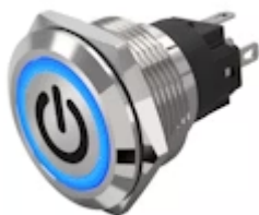
82-6151.1123.B002 Illuminated pushbutton Ø 22 mm silver contact