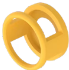
84-909 E-stop protective shroud